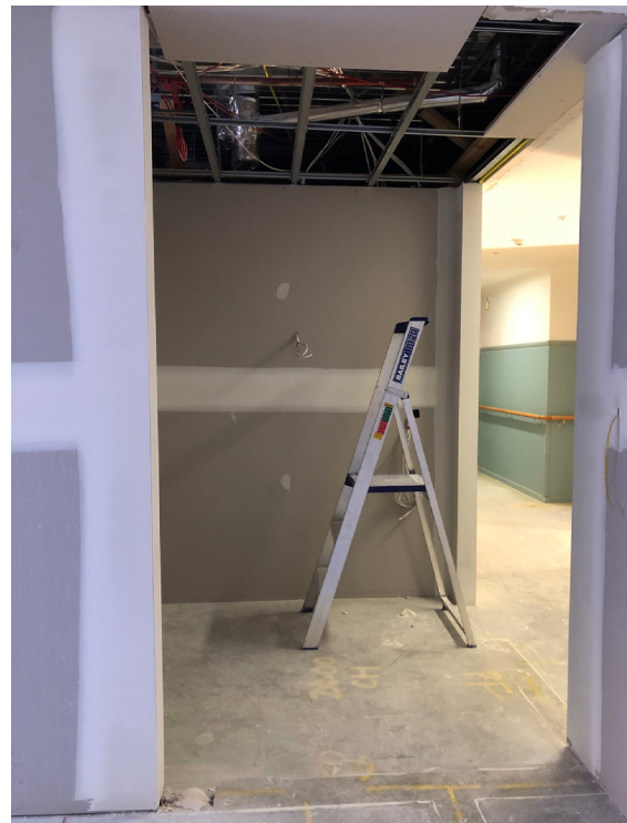
New Entry to Sybil's Lounge