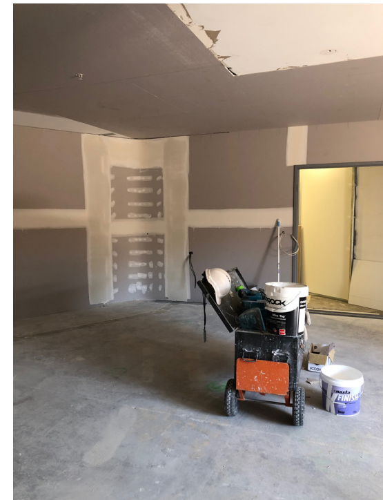
Sybil's Lounge looking South West